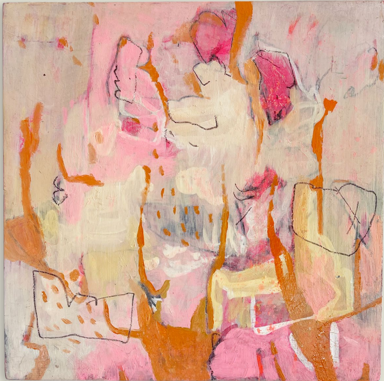
Marshmellow 2022 Oil on timber block 20 x 20 cm $200