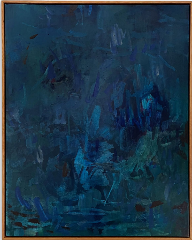
Boundary Cradle Blue 2022 Oil on canvas Framed in Oak 79 x 64 cm $1800 Framed